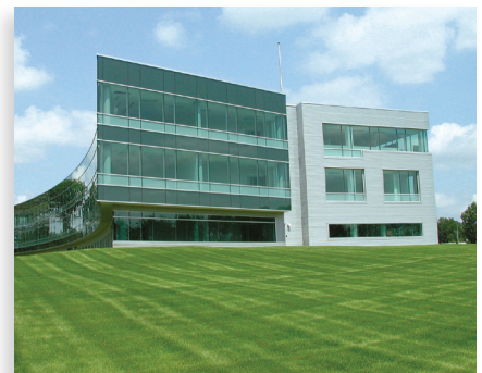
Mindray North America Headquarters Mahwah, New Jersey

For more information about Mindray products and services, visit www.mindray.com .