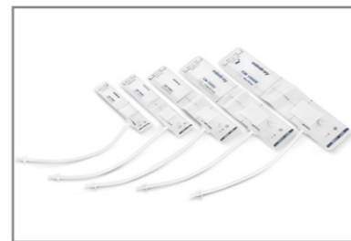
NIBP: Multi-size cuffs for different animals