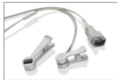
SpO 2 : Clips for animal tongue and ear