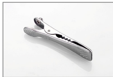
ECG: ECG crocodile clips will prevent falling and ensure signal stability